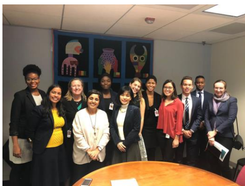
Eight Yale students worked with the World Bank to lead research on youth employment challenge in Jordan, Liberia and South Africa. Photo is from a recent World Bank Brown-Bag Lunch in January.

S4YE partnered with a diverse group of student researchers from the Yale University Jackson Institute for Global Affairs for research on three countries in which the Bank is currently designing youth employment operations - Jordan, Liberia and South Africa. Over four months, the students worked with the Task Team Leaders in the Social Protection and Jobs Group, conducted stocktake and gap analysis and compiled their findings in a report " Meeting the Challenge of Youth Unemployment: Analysis and Lessons from Jordan, Liberia, and South Africa ". They interviewed representatives from select programs, country experts and local youth themselves, cataloging a total of 108 interventions.